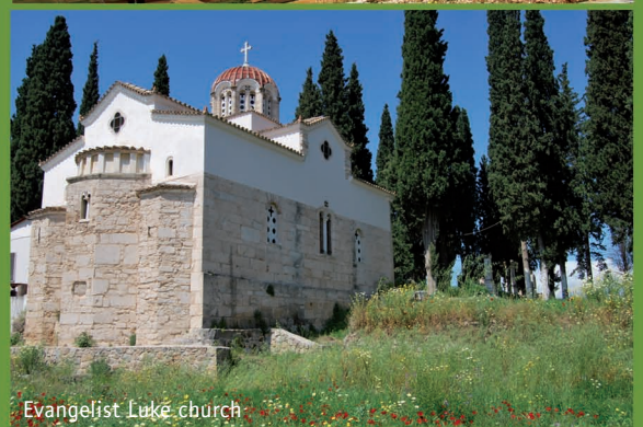
Evangelist Luke church