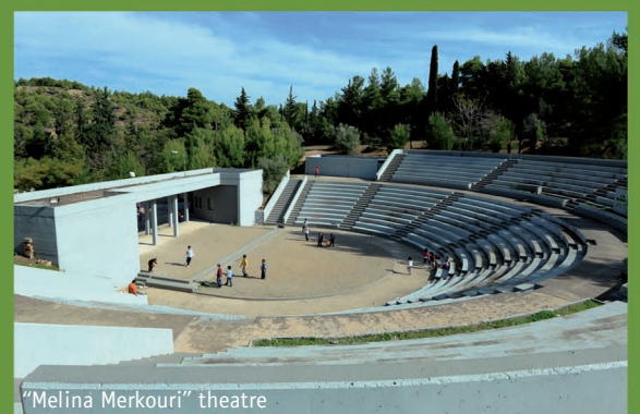
"Melina Merkouri" theatre