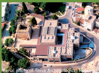
Aerial photo of Thiva Archaeological Museum