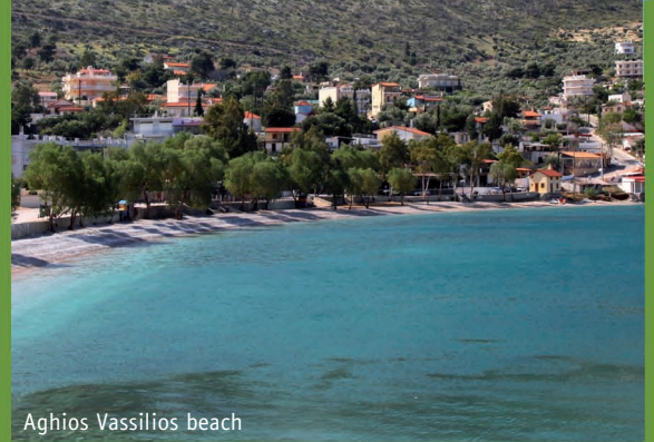
Aghios Vassilios beach

Thebes City Hall, 3 Kyprou Street | GR-322 00 Thebes Tel. +30-22623 50600 / 50607 | Fax +30-22620 27628 Email: dimosthivas@thiva.gr | www.thiva.gr