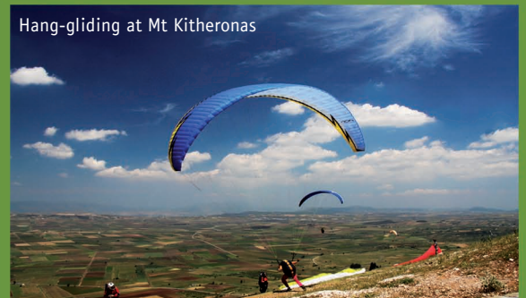
Hang-gliding at Mt Kitheronas