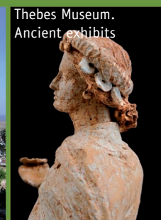
Thebes Museum. Ancient exhibits