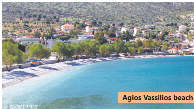
Agios Vassilios beach

braces beautiful shores and fiercely green mountain-sides, and enjoy the dreamy landscapes!