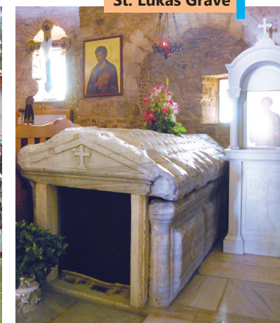
St. Lukas Grave